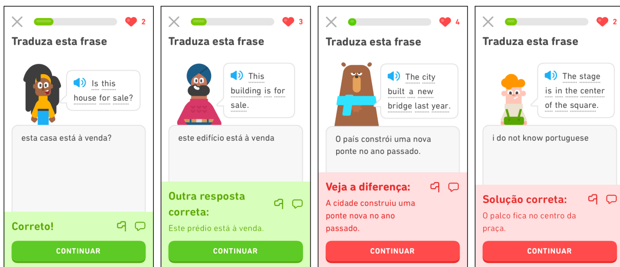
Figure 1: Screenshots from the Duolingo app (iOS, circa 2020), showing translation exercises for English prompts into Portuguese. The first two examples show correct student translations, with Duolingo suggesting an alternate, preferred translation in the second case. The third and fourth responses show incorrect translations.

field-tested accepted translations , each weighted and ranked according to their empirical frequency among Duolingo learners. We also provide a high-quality automatic reference translation of each prompt that may (optionally) be used as a reference or anchor point, in the event that researchers want to explore paraphrase-only approaches (this also serves as a strong baseline). See Table 1 for an example from the Portuguese dataset.